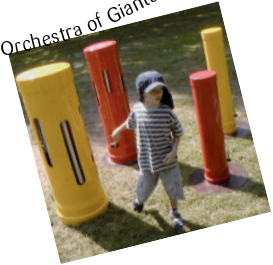
Orchestra of Giants Orchestra of Giants Orchestra of Giants