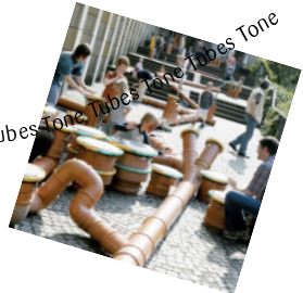
Tone Tubes Tone Tubes Tone Tubes