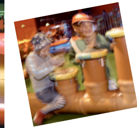
Tone Tubes Tone Tubes Tone Tubes