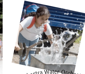
Water Orchestra Water Orchestra Water Orchestra