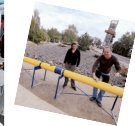
Orchestra of Giants Orchestra of Giants