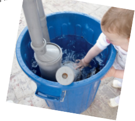
the Bottle-o-phone, the Kerplunk Clavier, the Dunk-Gong and the Funny sound Funnelcone... a wet-and-wild musical event not to be missed!