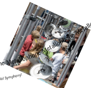
Metallophone Metallophone Metallophone