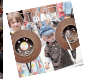
Metallophone Metallophone Metallophone